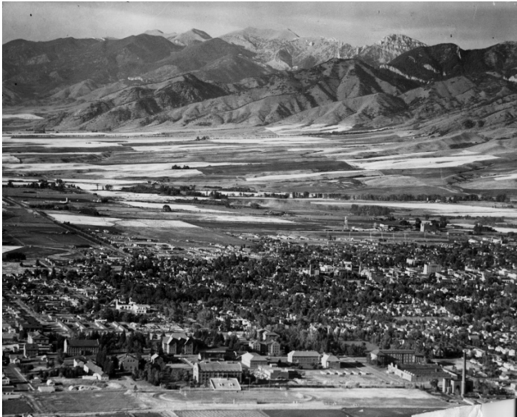
Caption: Aerial Photograph of Bozeman, 1953.